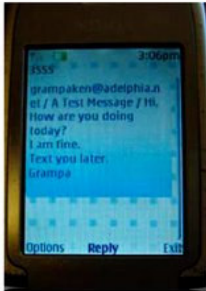
Appears on cell phone

Some of the common cell phone emails are: